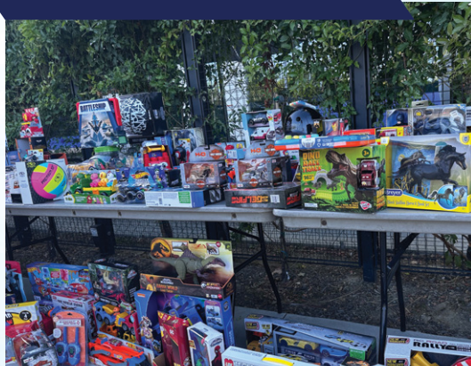
Quaid-Harley Toy Run