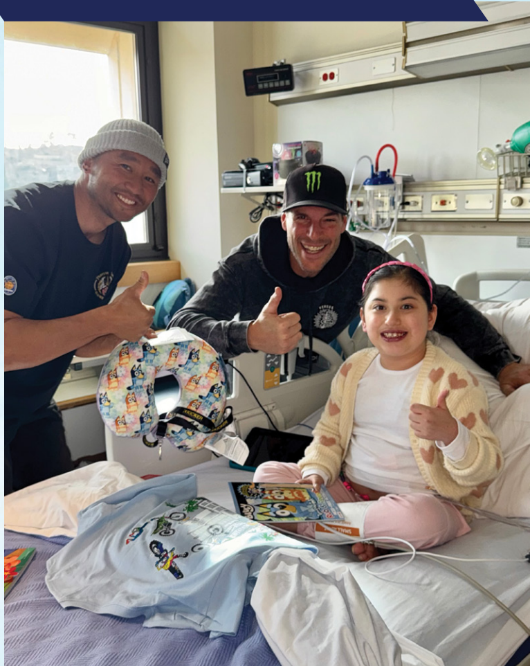
Big Air Kids Fair