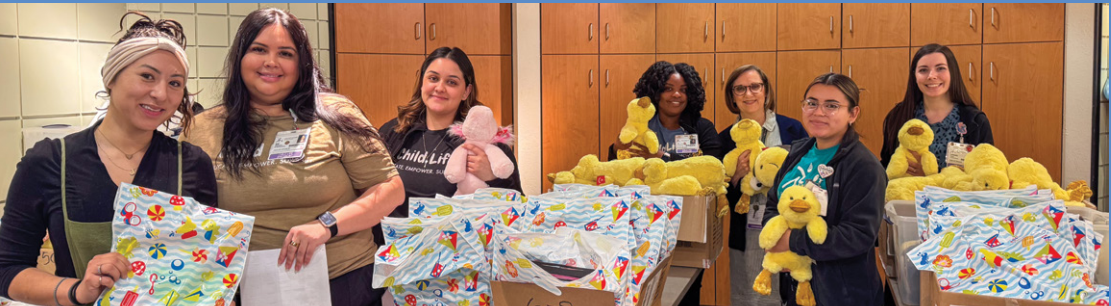
Spring into Reading