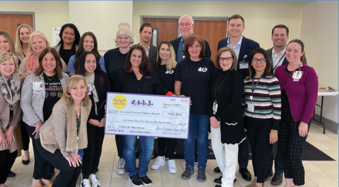
Spirit of Children Customer Fundraiser