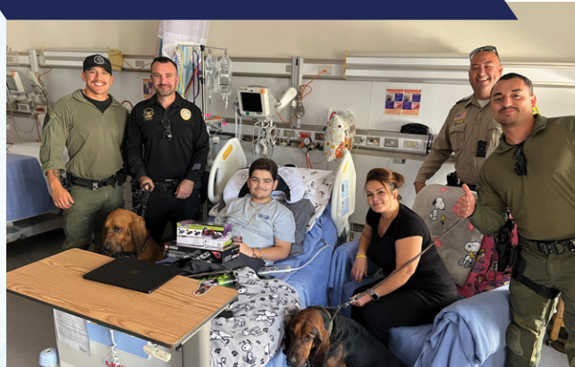
Cops for Kids Fly-In