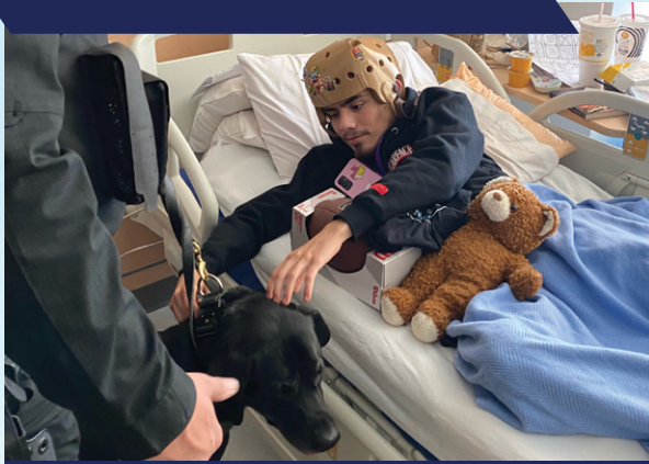
Cops for Kids Fly-In