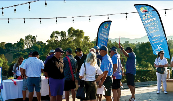
Walter's Charity Classic