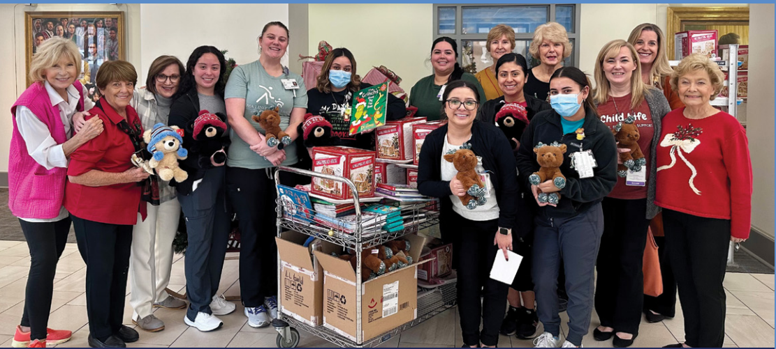
Gingerbread Decorating Day