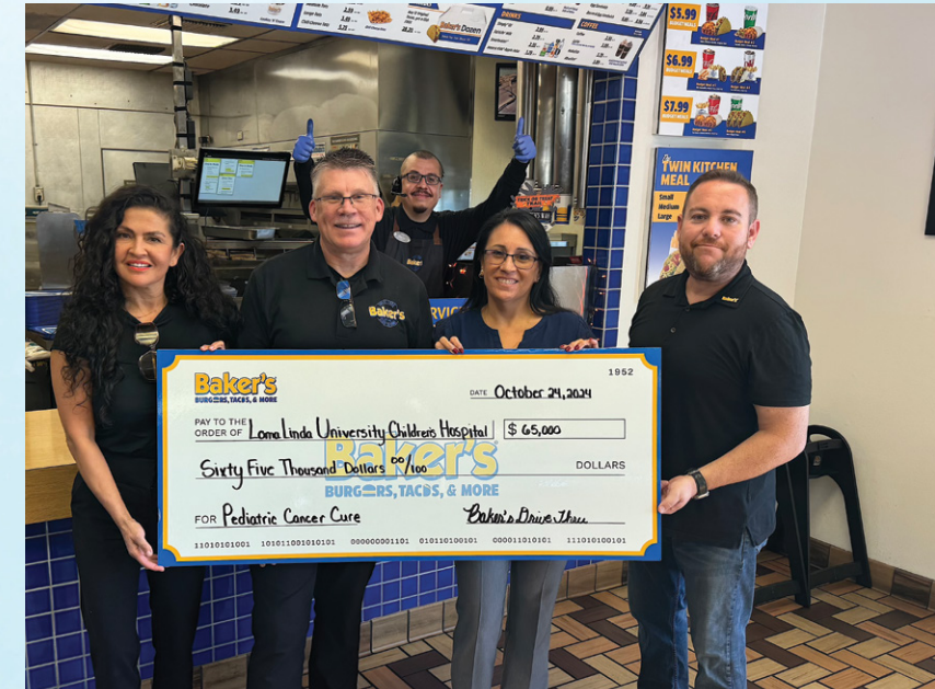
2024 check presentation

Beyond fundraising, Baker's has participated in fun patient activities, bringing joy and smiles to children facing difficult circumstances. Additionally, its support during the annual Stater Bros Charities K-Frogers 4 Kids Radiothon has been invaluable, helping to spread awareness and garner crucial support for the hospital. By leveraging its platform and engaging its customers, Baker's has become a true Champion for Children, and we are grateful for the efforts of Baker's Drive-Thru.