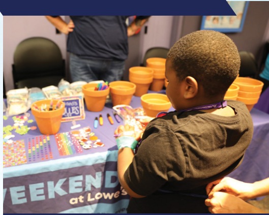
Partners in Play Day