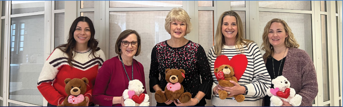
Loving Hearts, Loving You.