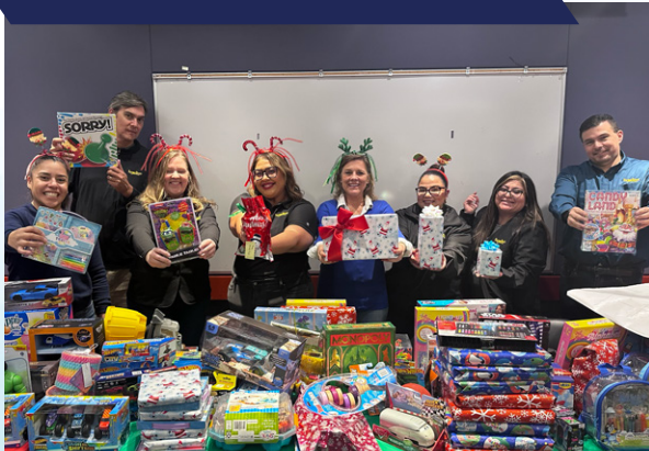
Spirit of Children Fall Festival