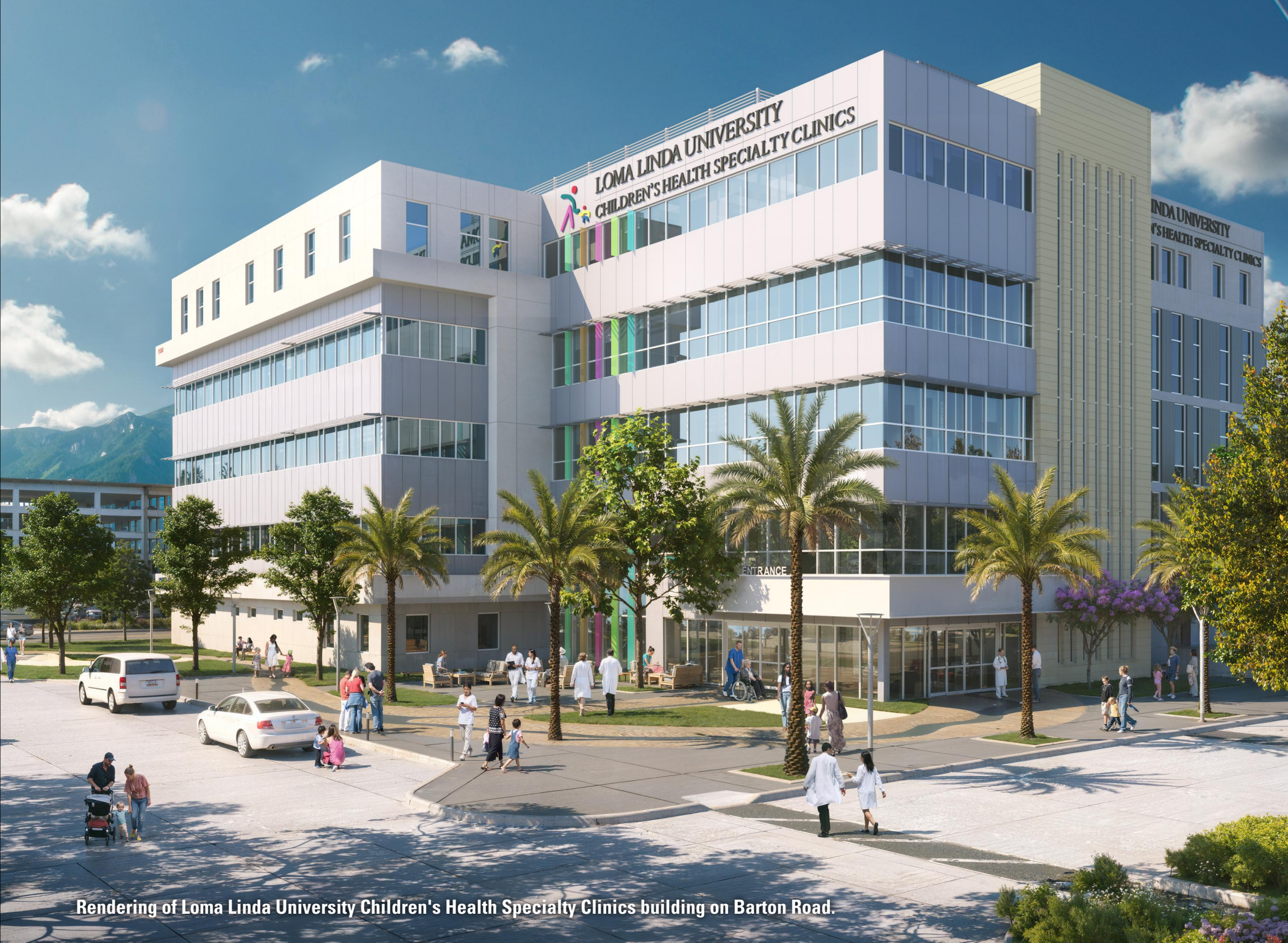
Rendering of Loma Linda University Children's Health Specialty Clinics building on Barton Road.