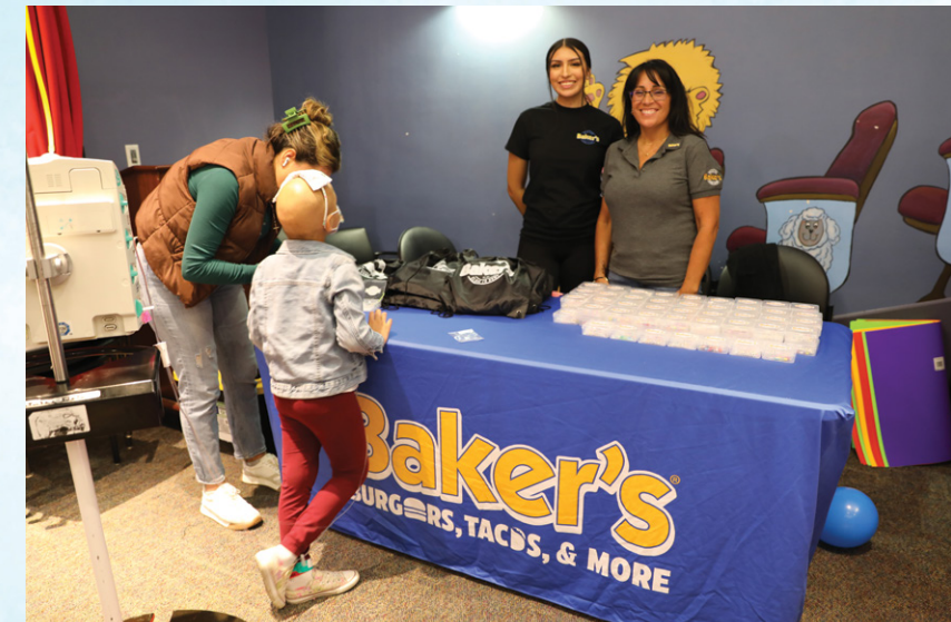
Baker's Drive-Thru team members helping at "Partners in Play" day at the Children's Hospital