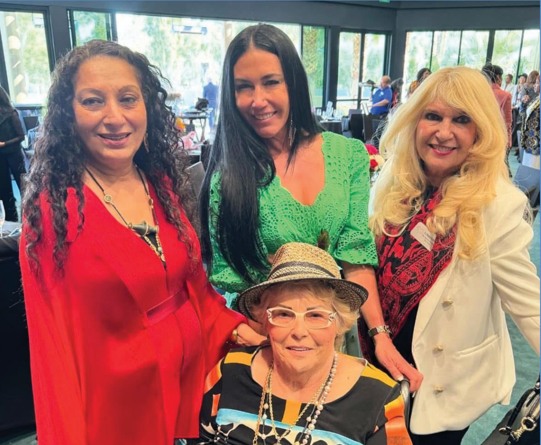
Fashion Show Luncheon Fundraiser