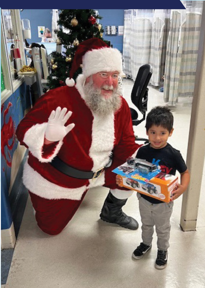
Val Verde PD Unit Visit

These fun activities brought much-needed joy to children facing extended hospital stays. Thanks to the dedication of our volunteers and generous business partners, we hosted numerous events that provided cheerful moments and a welcomed break from the clinical environment.