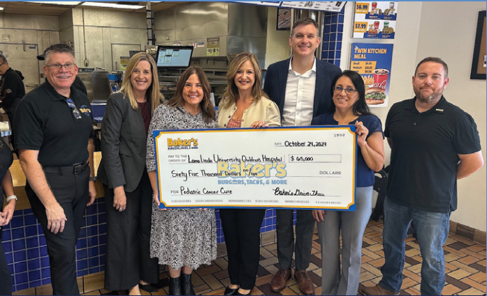
Bakers Drive-Thru Customer Fundraiser

Local businesses make a difference through creative fundraising efforts! We are so grateful for the effort and creativity our Champions put into their annual fundraisers.