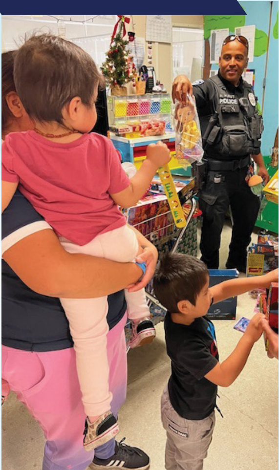
Shop with a Cop