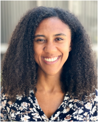
Hall, Loren Loma Linda University