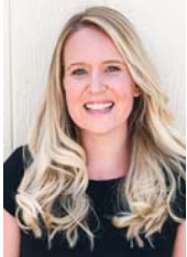
LeFlame, Candace Lake Erie College